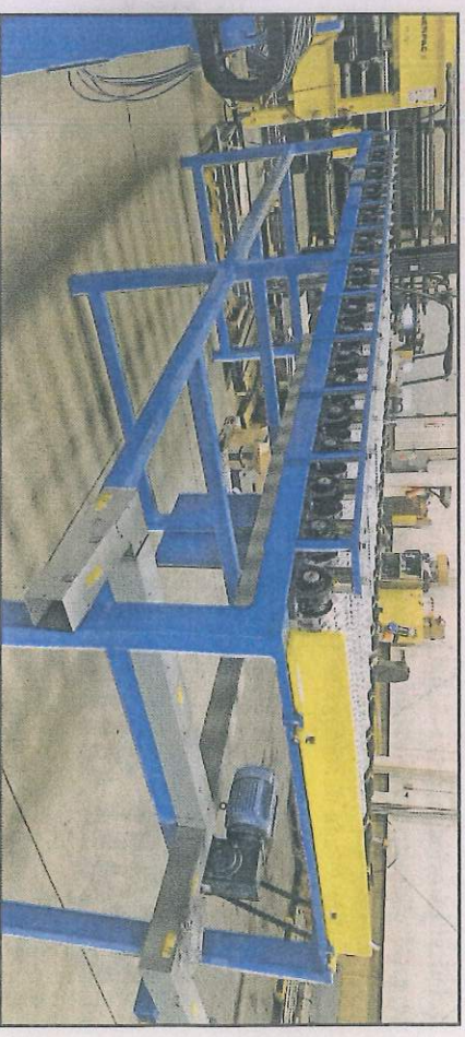
Material handling equipment in Projects Designed and Built's facility

According to Martin, the company supplies turnkey custom automation and material handling solutions that include – but are not limited to – process equipment, robotic integration, inspection equipment,